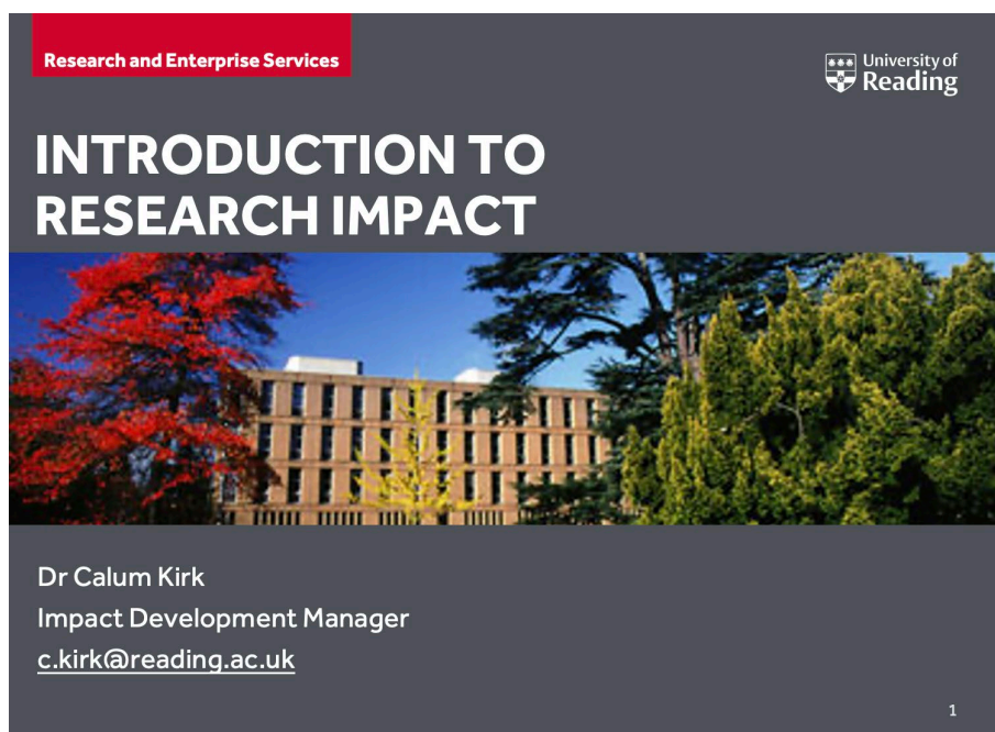
Figure 6. TS3 Session 3 lecture