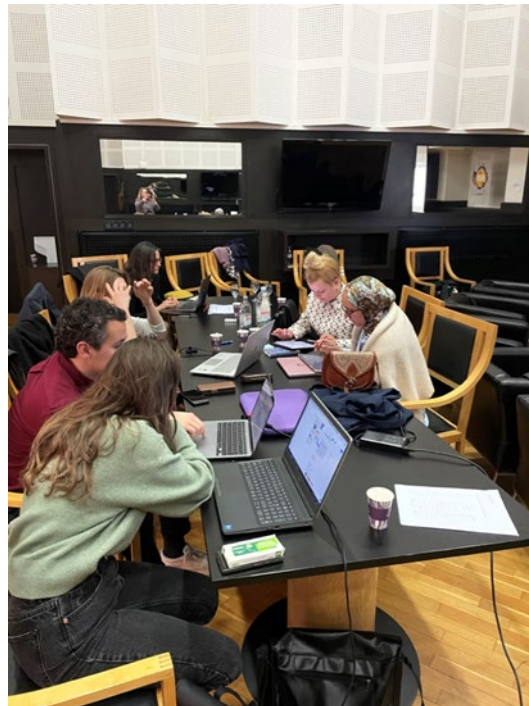
Figure 5. TS3 discussions in Zagreb workshops

As part of the Zagreb workshop in March 2023, there were two collaborative sessions between the RMT3 and TS3 courses, co-organized by Adrienne Csizmady (RMT3) and Lorraine Farrelly (TS3) (Figure 5). The objective of this activity was to assist ESRs in determining the most effective methods for disseminating their findings to non-academic stakeholders. Working in teams, ESRs identified and mapped target groups/non-academic actors, methods, and communication tools. The goal was to understand their connections to the three core RE-DWELL research areas: Design, planning, and building; Community participation; and Policy and financing.