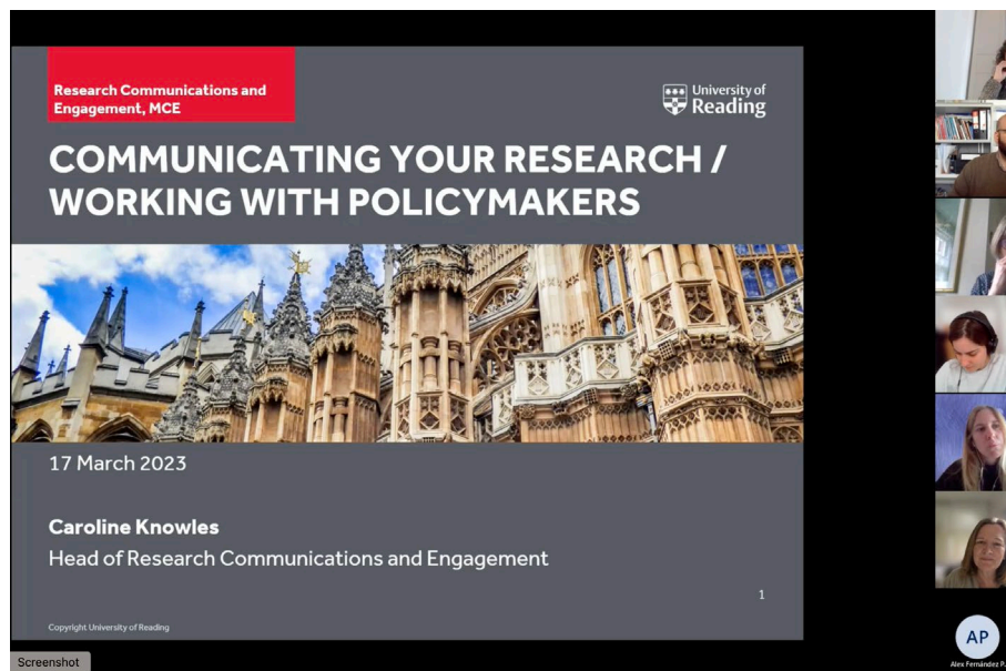
Figure 3. TS3 presentation on communication tools

The session was a presentation by Caroline Knowles from the University of Reading, an expert in communication of research, methods and techniques to communicate effectively. The session also included a Q and A with ESRs (Figures 3-4).