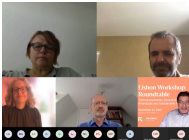
Figure 1. The roundtable participants of the 4th session of RMT1